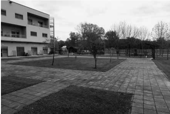
Gornja Radgona Retirement Home

of other people. On the basis of the expert's opinion, the NPM also recommended that in the event of insomnia and consequent behavioural symptoms, preference should be given to non-pharmacological measures over prescribing psychopharmacotherapy. The NPM further recommended that any complaints be examined thoroughly and consistently (e.g. fortnightly), as this is the only way to ensure their timely management. Another recommendation was that a special form be prepared for complaints or violations of house rules. The NPM recommended that appropriate visibility and readability of complaint paths be ensured on the notice board, as otherwise such a document does not serve its purpose. Staff should pay special attention, especially at night, to problems and inconveniences with regard to residents whose mobility is limited due to precautionary measures (e.g. bed rails) and who cannot go to the toilet on their own, and also with regard to residents who use the toilet themselves and do not use incontinence pads at night.