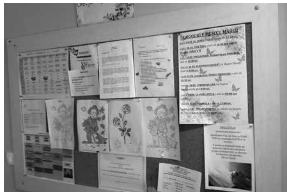
Notice board with the (too small) menu