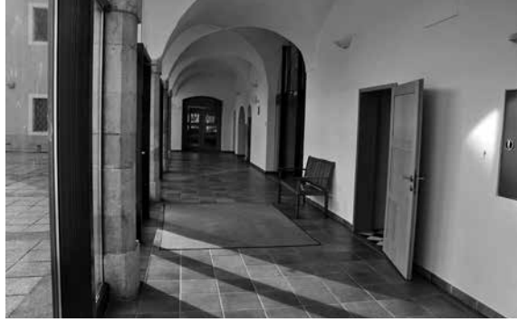
The cloister allowing movement of adolescents

We visited VG RTI on 21 February 2017 and, in addition to the central building, also inspected one of the residential groups and talked to the adolescents and teachers staying there. The NPM established that the living conditions in VG RTI are appropriate, the implementation of activities exemplary, and that the institution has implemented three of the ten recommendations which were provided during the last visit on 16 April 2014, while another four have been accepted and three remained unaccepted. During the visit, the NPM repeated its recommendation 15 , which had already been provided on 16 April 2014, that the prepared individual plan should also be given to the adolescent for inspection and signature 15 , which had already been provided on 16 April 2014, that the prepared individual plan should also be given to the adolescent for inspection and signature 16 .