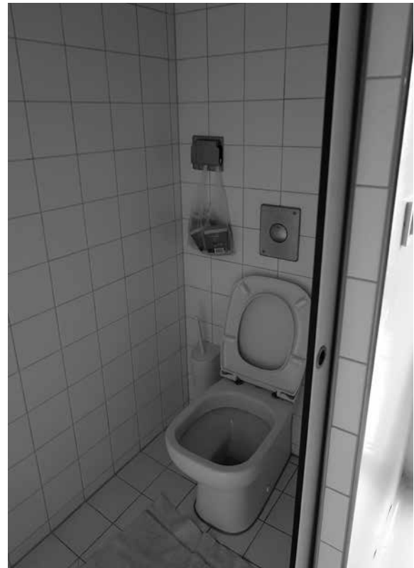
Bathroom and toilet in the hospital room in Department V of Dob Prison with a narrow entrance, high doorstep and no grab bars.