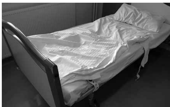
Ordinary bed with Segufix restraints