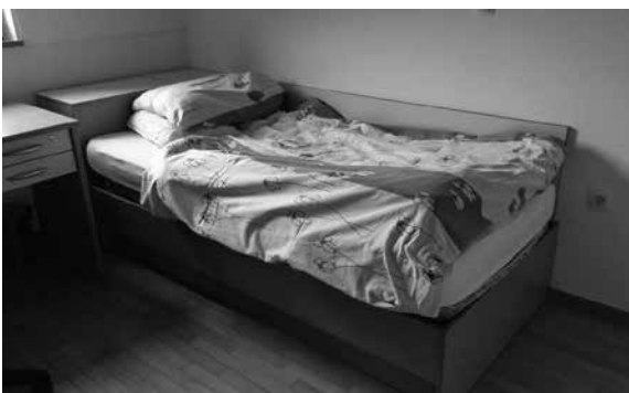
Room in the residential group