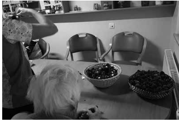
Activities for residents