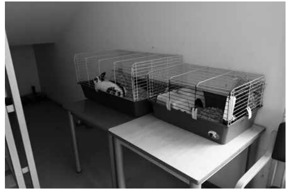
Pets in the department