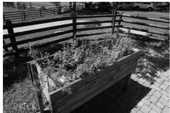
Raised garden bed

On 20 September 2017, we visited the Idrija Unit of the Idrija Retirement Home . This was the first visit to this unit of this social care institution in the context of implementing the duties and powers of the NPM. During the visit, 13 recommendations were made, of which 11 have already been accepted and implemented and one has been accepted but not yet implemented. One recommendation has been addressed to the Ministry of Labour, Family Social Affairs and Equal Opportunities, and we are still waiting for the answer (at the time of preparing this text, the deadline for the answer had not yet expired). With regard to the visited retirement home, the NPM recommended to the Ministry to check the reasons for the lengthy decision-making on the meeting of conditions for the verification of a secure department and to inform us of these reasons, and to ensure decision-making on the meeting of conditions for the verification of secure departments in the shortest possible time. In addition to the recommendations provided below, it was recommended that Idrija Retirement Home strive for the