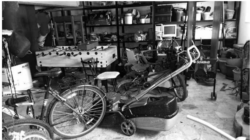
Unkempt recreation and calm down area