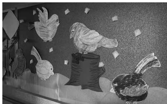
Decoration in common area

A review visit to Hrastovec SCI was made on 11 April 2017. During the visit, it was established that of the 24 recommendations which were made during the 2015 visit, ten recommendations have already been implemented, and twelve have been accepted but not yet (fully) implemented. This indicates that the institution took the recommendations seriously and made an effort to implement or at least start to implement most of them. It was unfortunately established that the institution has not