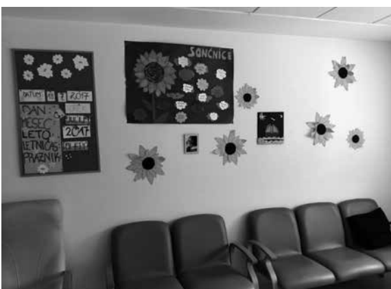
Common area in Lipa Retirement Home