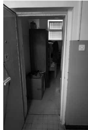
Narrow entry to the Maribor Prison living area, the Murska Sobota Unit