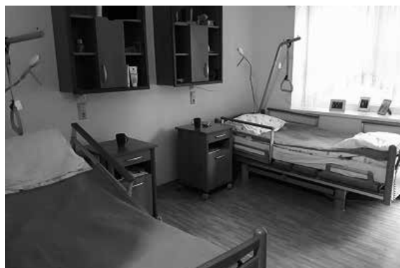
Room in the Juršinci Unit