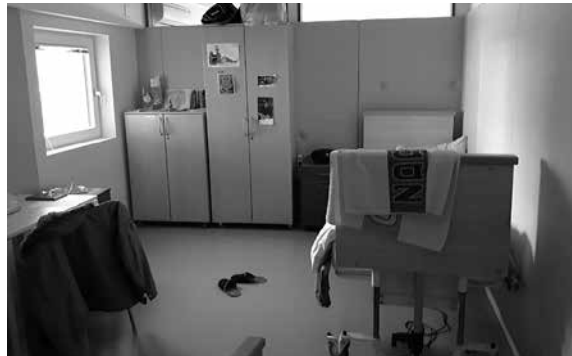
Refurbished calm down area