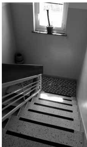
Rooms of children and adolescents in Črnavá RG