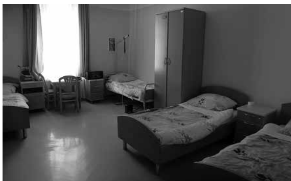
Room in Petrovo Brdo special social care institution

A review visit to the Petrovo Brdo Unit was made on 19 January 2017. It was established that of the 12 recommendations which were made during the 2015 visit, six have been accepted and five already implemented. One recommendation remained unaccepted 5 and was specifically emphasised during this visit, together with the recommendation that the unit try to implement it as soon as possible. The general impression after the visit was positive and we found the living situation to be rather good, which was also confirmed by residents during our talks.