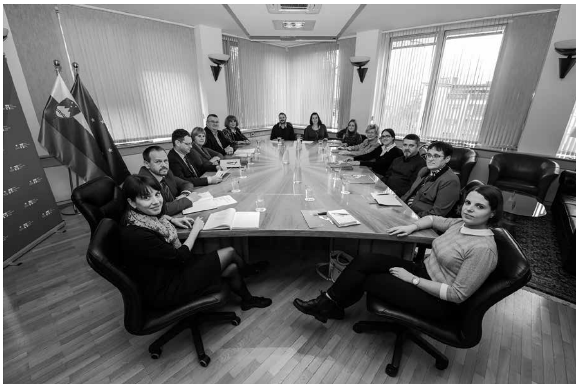
Meeting of members of the National Preventive Mechanism with the representatives of non-governmental organisations cooperating with the Ombudsman in the implementation of the duties and powers of the NPM.