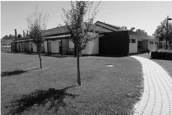
Residential Unit of Ljutomer Retirement Home

to the recommendations explicitly stated below, the NPM also recommended that the staff regularly ventilate rooms to eliminate unpleasant smells and improve the living environment for everybody in the department. It was also recommended that the institution regularly monitor the satisfaction of employees, residents, and their family members. In light of the expert's findings, the NPM recommended that more frequent psychiatric exams of residents be made (at least once a month), as exams made four times a year do not enable a quick enough termination of residence in the secure department should the medical condition of the resident change. The NPM also recommended that the strip between the terrace and green areas be removed or levelled, as there is a risk of falling when stepping on the gravel, and that leaking of water from the overhead roof to this path be prevented. In light of the expert's opinion, the NPM recommended that the institution consider setting up a secure department in the unit in Ljutomer, and that the continuous availability of medical documents in the residential unit is ensured. Furthermore, a record of complaints should be set up and a visible and readable summary of the house rules should be available in a clearly visible location in all departments.