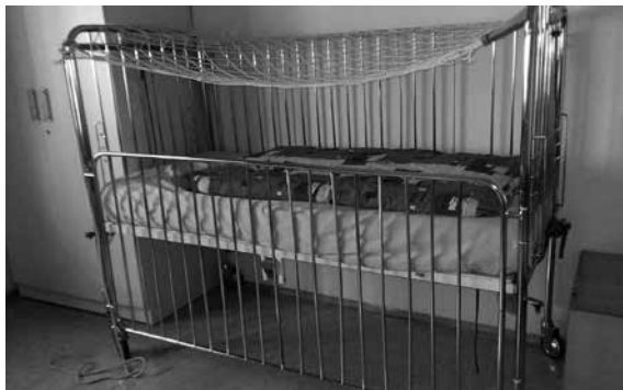
One of the five enclosure beds

Enclosure beds were noticed in this institution but no (medical) records were being kept on their use as stipulated by the ZDZdr for the implementation of special precautionary measures. One of these beds is shown in the photo::