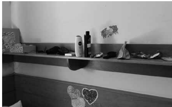
Rooms and furniture in one of the residential groups of PRTI