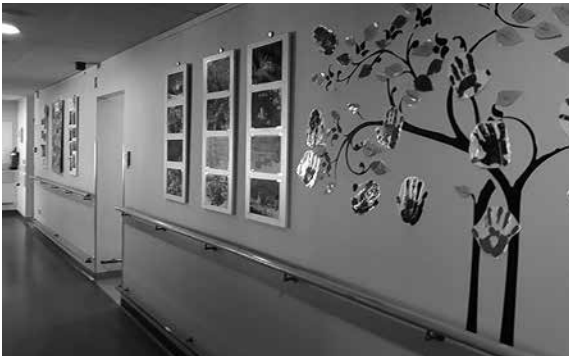
Dom Nine Pokorn Grmovje

On 6 December 2017, we made a review visit to Dom Nine Pokorn Grmovje . At its 2015 visit, the NPM made 16 recommendations. During the visit, it was established that 10 of these recommendations have been accepted but not yet (fully) implemented, while six recommendations have already been implemented. This indicates that the institution took the recommendations seriously and made an effort to implement or at least start to implement most of them. During its review visit, the NPM made 6 new recommendations, which, in the light of its response to the preliminary report, the institution has predominantly already implemented, which is commendable. It was recommended that the institution update its website, as it was established that residents, and especially their family members, can receive the majority of explanations with regard to activities and planned events online. It was recommended that the residents be informed about the operation and importance of call buttons (distress calls). As the institution emphasised problems with admittance of residents to the nearby psychiatric hospital, we recommended a meeting with the hospital's management in order to search for possible solutions. One recommendation is awaiting implementation; however this depends on objective factors (the start of construction of a new secure department).