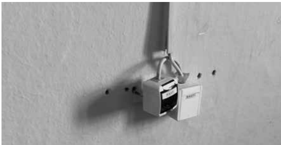
Damaged socket at Ig Prison

We pointed out the need to eliminate minor deficiencies or damage to equipment and inventory (e.g. damaged electrical sockets, non-functional light bulbs, etc.) to Ljubljana Prison – the Ig Open Unit, Dob Prison – the Slovenska vas Semi-Open Unit, Ig Prison, Radeče CF, and Koper Prison . We recommended that employees be alerted to show more self-initiative when establishing such deficiencies. With regard to these recommendations, the Prison Administration said that the deficiencies and damage had been fixed. It further said that employees had been alerted to establish any damage or deficiencies themselves and to take immediate action.