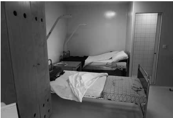
Hospital room in Dob Prison in the new Department V

The majority of the prisons and remote units have a room which is designated as the hospital room (Dob Prison, Ljubljana Prison, Ig Prison, Koper Prison, Koper Prison – the Nova Gorica Unit, Maribor Prison – the Rogoza Unit, Celje Prison and Juvenile Prison); however, these rooms are also not equipped with appropriate hospital beds (usually only with old and worn out beds). The beds in these rooms cannot be adjusted (in height and position) and not all (during the thematic visits) had a hospital bed trapeze to assist patients when getting up.