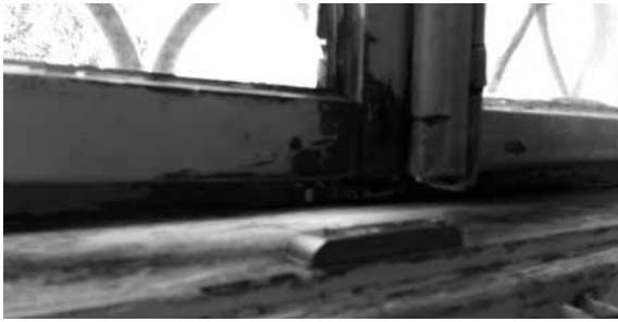
One of the windows in Ig Prison which cannot be closed.

The Prison Administration further said that the possibility of replacing the windows would be studied, while the institution would continue checking the seals and implementing appropriate measures in accordance with its capabilities.