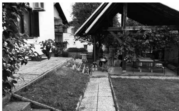
Outdoor multi-purpose area of the Kranj residential group (RG)

We visited KrRTI on 1 June 2017 . We inspected the main unit, the residential group in Šempetrska cesta in Kranj, and the Černava residential group in Preddvor. We inspected documents and spoke to several adolescents and staff. During the visit, the representatives of the NPM got the impression that living conditions were appropriate, the implementation of activities exemplary, and that the institution has accepted and implemented all the recommendations made during the last visit on 29 September 2015. 33 During the visit, 25 new recommendations were made. Judging from the