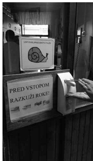
The entry to the Polži unit is locked for reasons of residents' safety