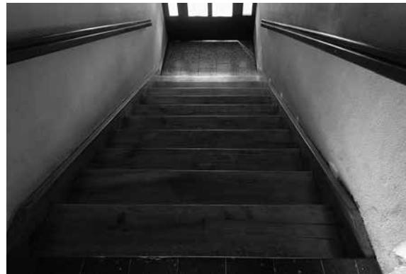
Staircase in Ig Prison

None of the prisons or their remote units (yet) employ staff or caregivers who could provide vulnerable people in custody with the required assistance with personal care and hygiene or other similar activities. Our findings show that such assistance is regulated differently in different prisons and their remote units. It is offered by health staff or an outsourced provider/caregiver, so it is not uniformly regulated who pays for these services (in some cases, the services are paid for by the person in custody; in some cases by the prison on the basis of a work order; or in others by the Health Insurance Institute of Slovenia on the basis of a work order by the prison clinic).