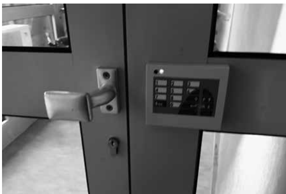
Entry to the secure department