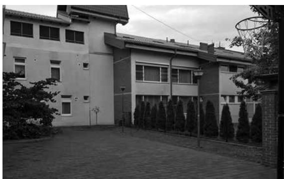
Lukavci Retirement Home