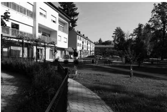
Ptuj Retirement Home, Kidričevo Unit

On 22 May 2017, we visited the Kidričevo Unit of Ptuj Retirement Home . This was the first visit to this unit of this social care institution in the context of implementing the duties and powers of the NPM. During the visit, 10 recommendations were made. After receiving the response to our preliminary report, it was established that the unit has already implemented six of the recommendations, which is more than half. It was further established that it has accepted but not yet implemented four recommendations. In addition to the recommendations which are explicitly stated below, it was also recommended that this unit starts to invest in improving communication with employees and consequently also in establishing the (concrete) dissatisfaction of employees and studying the possibilities for improving employee satisfaction. It was also recommended that the record of psychiatric visits be supplemented so as to show which are periodic and which are exceptional examinations of residents, and that an effective control mechanism be established to prevent cases where delays in notifying the court would result in residents being detained in secure departments for specific periods without an appropriate legal basis. It was further recommended that, in the event of written complaints, residents receive a written answer and, if necessary, this answer is additionally verbally explained.