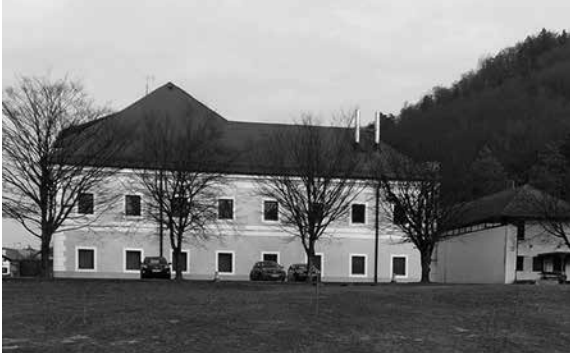
The central building of VG RTI