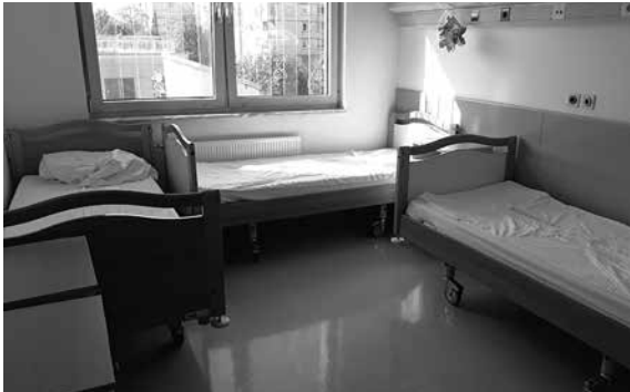
Room in the Unit for Forensic Psychiatry

On 2 October 2017, we again visited Maribor University Hospital ; this time the Unit for Forensic Psychiatry (Unit) . This was a review visit to see how the recommendations provided by the CPT during its 2017 visit are being observed. In its report on the visit, the CPT made 14 recommendations . The NPM established that the Unit has accepted but not yet (fully) implemented nine recommendations, while the remaining five recommendations, including some of a more systemic nature, have also not been implemented. It was recommended that the Unit seriously starts to implement the recommendations, and that it makes every effort to implement the CPT's recommendations in the shortest possible time. During the visit, two new recommendations were made regarding the provision of systemic or legal conditions for the Unit's operation. We are still waiting for the response to these recommendations. The general finding after the visit was that the situation in the Unit is improving, both in terms of shortage of space and patient satisfaction. There is of course still room for improvement, as indicated by the CPT's recommendations.