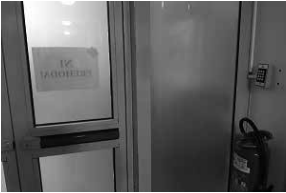
Entrance to the secure department in the Muretinci unit

information; and that the form for recording falls be adapted so as to regularly and promptly include the reason for the fall, if one can be established.