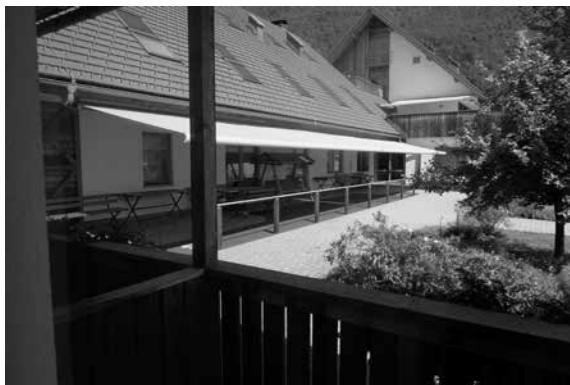
Dom Sv. Martina Retirement Home in Srednja vas v Bohinju