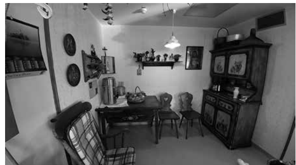
Department furnished to feel like home

On 29 November 2017, we visited the Muretinci Unit of Ptuj Retirement Home . At this year's (review) visit, it was established that of the 13 recommendations made in 2015, 7 recommendations have been accepted and implemented . The unit was objectively unable to implement two of the recommendations due to renovations; however, the answers they provided allow us to conclude that they plan to implement these recommendations in the future. The unit will undoubtedly try to implement the remaining four accepted but not yet implemented recommendations. At its visit, the NPM made five new recommendations and we are still awaiting the answer of Ptuj Retirement Home with regard to their acceptance or implementation. The NPM recommended that residents be repeatedly reminded of the existence and purpose of call buttons and shown how to use them; that the possibility of moving the dining table so that all seats are available be examined; that one copy of the activity schedule be put on the notice board; that statutory deadlines under the ZDZdr be observed and that admission records be managed consistently and contain all required