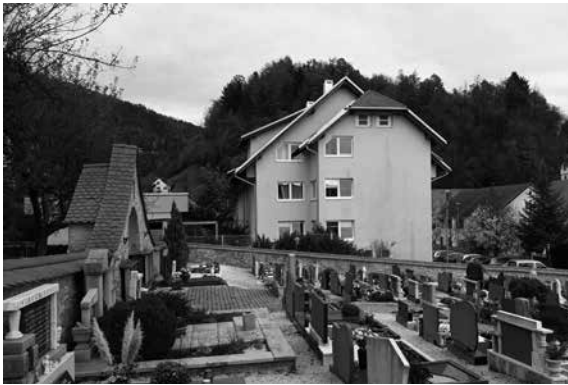
Horjul Retirement Home

adverse effects of non-compliance with a diet be explained to the resident despite a signed statement and that the residents be encouraged to accept the prescribed diet. As the identification badges of staff are important to facilitate their identification and communication with relatives or the identification of an employee in the event of wishing to file a complaint, it was recommended that staff are provided with appropriate badges or patches enabling such identification. It was further recommended that special records be kept for periodic psychiatric examinations, as this would reduce the search time while at the same time also reducing the possibility of overlooking a resident who might need an examination. The retirement home should also consider setting up a system allowing relatives to make an appointment if they wish to talk to the resident's doctor. It was recommended that the retirement home and the attending psychiatrist set up a system which will ensure that deadlines for submitting requests for prolonging detention will no longer be exceeded. A transparent record of complaints should be set up enabling a better overview of the number and type of complaints, and serving as a reminder of what could be improved to increase residents' satisfaction. It was recommended that the residents' ability and interest in participating in elections is continuously checked, as this is a constitutional right of every individual..