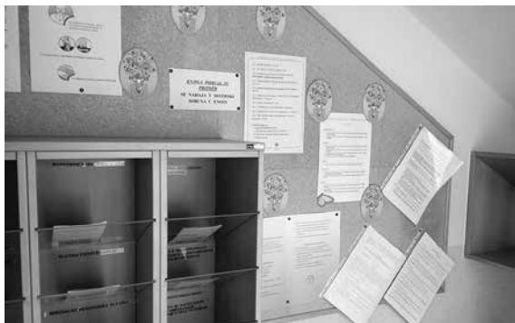
Impoljca Retirement Home

recommendations. The majority of these recommendations refer to the implementation of SPM. In its response to the recommendations provided during the 2015 visit, the institution said that it was not implementing SPM, a fact disagreed with by the NPM, as the use of lap belts is undoubtedly a SPM as defined by the ZDZdr (physical restraint using belts). The institution did explicitly respond to the recommendations regarding the placing of a sufficient number of brochures in the special drawer in Department C, and providing residents with toiletries. We are convinced that they will observe these in their future work. In the light of the above, we have established that the situation is improving; however, the large number of non-accepted and new recommendations shows that the institution still has a lot of work to do. We have therefore recommended that they keep paying attention to the good living conditions of its residents and to carefully consider Article 29 of the ZDZdr, which defines SPM. We specifically pointed out our concern that despite the NPM findings that individual residents were obviously unable to independently leave the institution, Impoljca Retirement Home does not have (a documented) legal basis, which can constitute an offence under the penal provisions of the ZDZdr. It was recommended that the institution try to implement the recommendations made by the NPM, thus improving the situation.