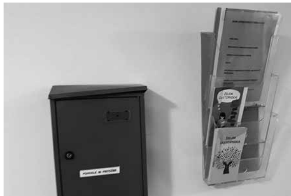
Complaints and compliments box