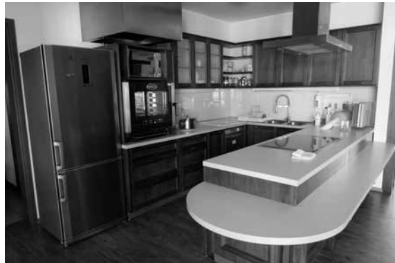
Room for food preparation in the unit