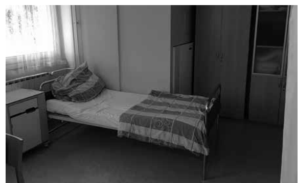
Additional bed in the common area