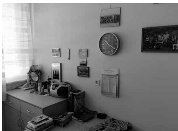
Nicely furnished room