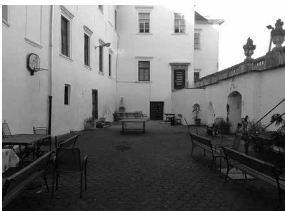
Hrastovec SCI, courtyard in secure departments