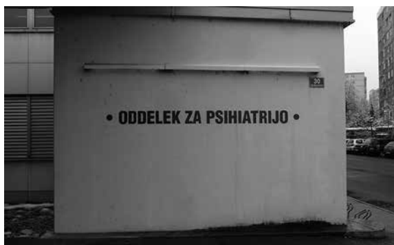
Maribor University Hospital, Psychiatric Department