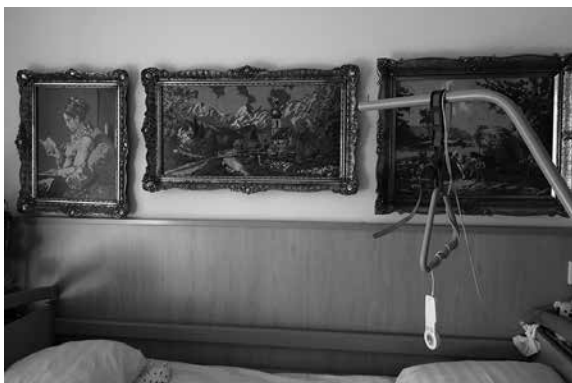
Room in Fužine Retirement Home

explained, as this is the only way for residents to be correctly informed of the Committee's reasons and for the opinions of residents, family members, and legal representatives to be correctly recorded.