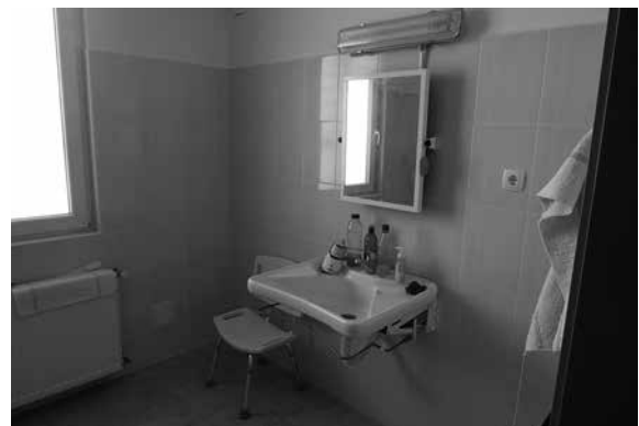
Appropriately arranged toilets