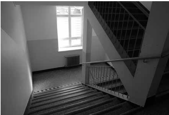
Staircase in Ljubljana Prison