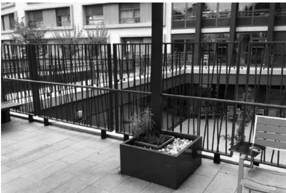
Idrija Retirement Home

rooms of residents and common areas to be aesthetically equipped and furnished with the help of relatives and occupational therapy, contributing to the residents accepting these facilities as their true home. The television in the secure department should only be turned on if a resident wishes to watch it, or if residents are watching it in the presence of and with the appropriate assistance or explanation of employees. Sitting residents down in front of the TV so as to distract them or because no other activities are available is not appropriate. It was further recommended that residents are offered a daily newspaper (in agreement with the residents) allowing them to learn about daily news from across the globe (alone or with the help of the staff), and more importantly from their local community which they perhaps still remember. The NPM recommended that they study the possibility of visits by therapy dogs or other animals, as residents obviously respond well to contact with animals. The retirement home should also try to attract appropriate volunteers for socialising and other activities in the secure department, as this would make the lives of residents more versatile and interesting. The NPM recommended that the retirement home pay attention to the timely submission of the proposal to the court to issue a detaining order and for prolonging detention in accordance with the provisions of the ZDZdr.