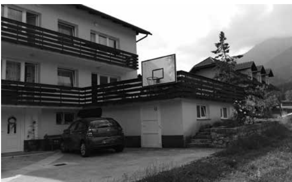
The house of the Černava residential group