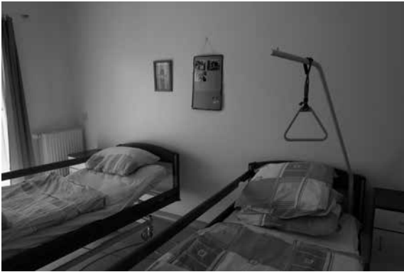
Room in Dom Sv. Lenarta