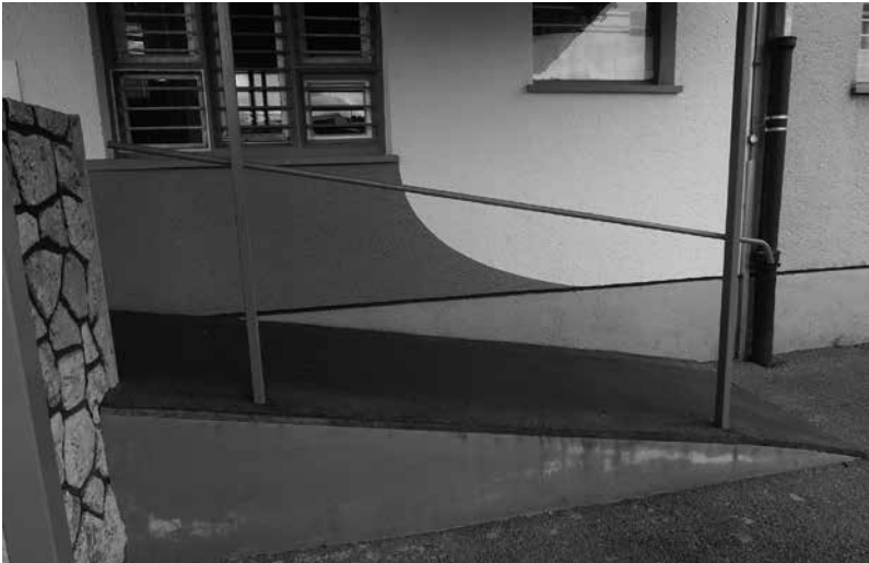
Too steep ramp in Department III of Dob Prison