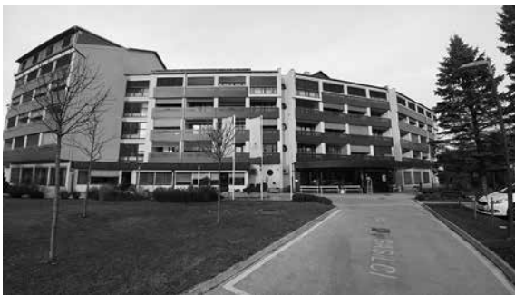
Dr Janko Benedik Retirement Home in Radovljica