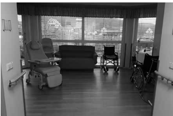
Juršinci Unit – common area with a couch