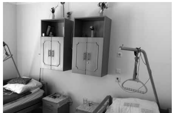
A nicely equipped room in the Unit

On 12 June 2017, we visited Ljutomer Retirement Home . This was the first visit to this social care institution in the context of implementing the duties and powers of the NPM. During the visit, 15 recommendations were made and, as is evident from their response to our preliminary report, the institution has already implemented nine recommendations, i.e. almost two-thirds of them. The institution has accepted another six recommendations but has not yet implemented them. In addition