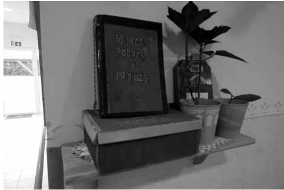
Opportunity to submit (anonymous) complaints

On 10 March 2017, we made a review visit to Dom Viharnik in Kranjska Gora . It was established that of the 13 recommendations which were made during the 2014 visit, almost all have been accepted and already (at least partially) implemented . Six new recommendations were made. The institution's response to our preliminary report shows that four recommendations have already been implemented and two have been accepted and are awaiting implementation. In addition to the recommendations which are explicitly mentioned below, it was recommended that the retirement home establish efficient control over the preparation and handing out of therapies, and print the menu in a larger format so that residents will be able to read it. The general impression after the visit to Dom Viharnik was positive and we found the living situation to be good, which was also confirmed by the residents during our talks.