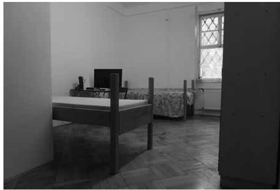
Hospital room in Ig Prison

The ZIKS-1 stipulates that every prison must have a hospital room for the accommodation and treatment of prisoners. With regard to the equipment in hospital rooms, the ZIKS-1 only stipulates that a hospital room must be equipped in accordance with the general rules and regulations (the first paragraph of Article 60 of the ZIKS-1). Appropriate equipment in hospital rooms is also stipulated by the second paragraph of Article 47 of the PIKZ; however, it does not specifically determine it.