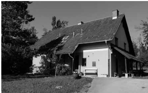
The central building with offices and primary school classrooms

We visited PRTI on 16 May 2017 . We inspected the facilities and talked to the children and adolescents and the staff. After the visit, we reviewed the documents in the personal files of six adolescents. Based on the information that it obtained during its visit and after reviewing available documents, the NPM believes PRTI is carrying out its activities in accordance with its mission. Of the 11 recommendations which were made during our last visit on 12 May 2015, the institution has implemented four and accepted two of these recommendations. Two out of the five recommendations have been implemented only by the PRTI and not also by the competent ministry 29 and the NPM therefore repeated the recommendations during this year's visit.